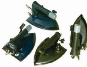
All Steam Press