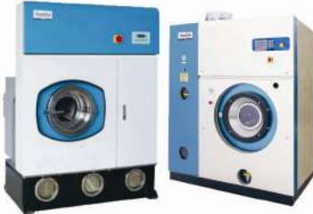
Dry Cleaning machine