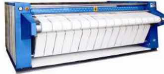
Flat Work Ironer